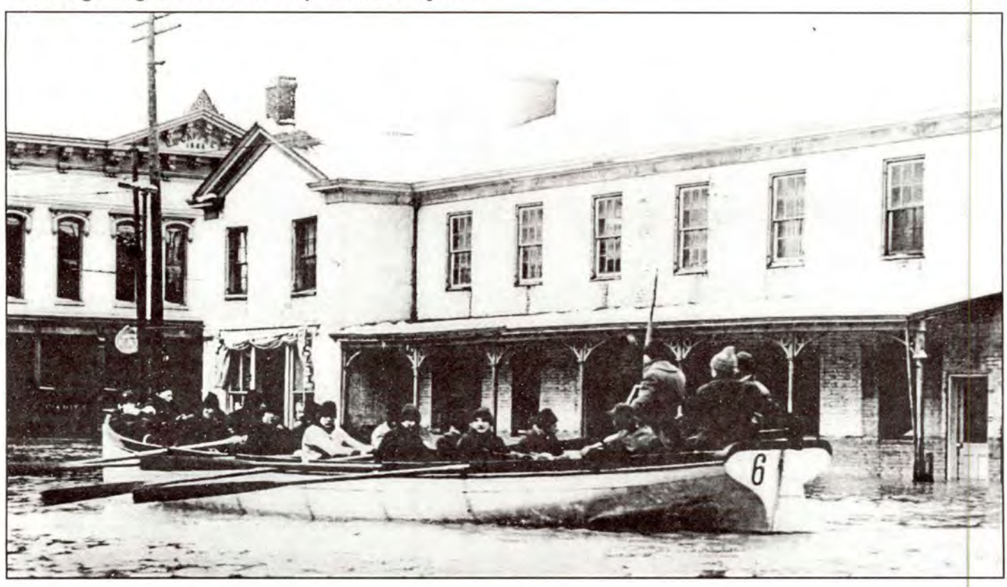
The decision by Lt. Col. Leigh Gignilliat, Culver's superintendent, on the night of March 26, 1913, to send four of the Naval School's cutters to perform rescue work during the Logansport flood involved a commitment to a risky venture. So great was his faith in the young men of the corps that he did not hesitate to tell the mayor of Logansport he would participate in the rescue effort.