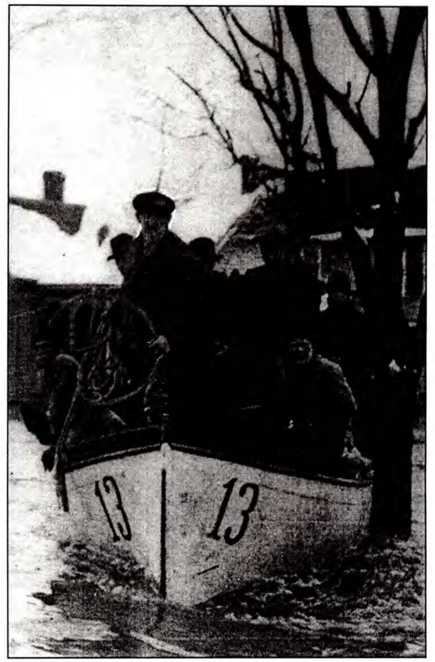
When the train carrying the Culver cutters arrived at Logansport, the water almost reached the floor level of the flatbeds. It was a simple matter to slide the boats into the water and begin the rescue operation.

In the aftermath of the rescue operation, cadets enjoyed