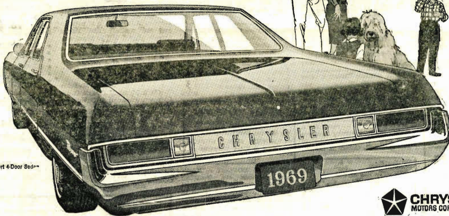
Newport 4-Door Sedan