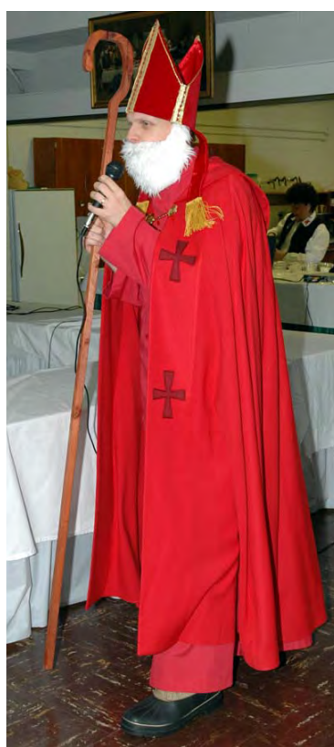
St. Nicholas, seen here at St. Mary's in 2005, will return to Culver on St. Nicholas Day, Dec. 6.