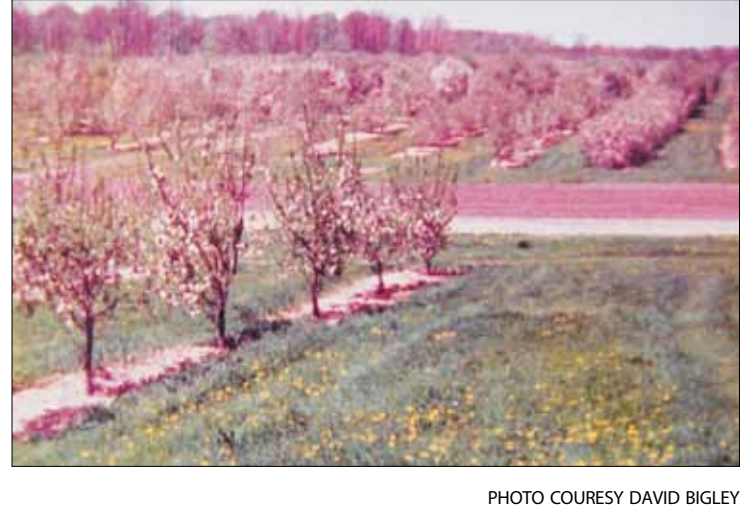
These rows and rows of Bigley's apple trees on Queen Road (note the road in the middle of the photo) were a glorious sight remembered fondly by your editor and many others in the area.

My hope, of course, is that those readers with similarly fond memories of Bigley's orchard will enjoy - as I did - digging into the "back story" (for those not already familiar) of the family and circumstances which led to its existence and longevity, and those readers without those memories will get a sense of why that humble little store and those unassuming, rolling acres were special to so many of us.