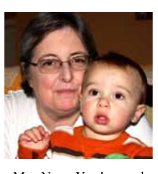
New Year's resolu-I have and spend more time straight! with my family!

Several Culverites were asked for their New Years' resolutions for 2010 this past week. Below are some of their replies.