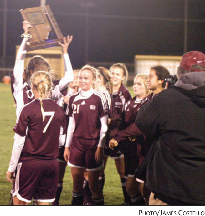
Members of the CGA girls soccer team celebrate their sectional championship win over Plymouth at Argos Saturday.