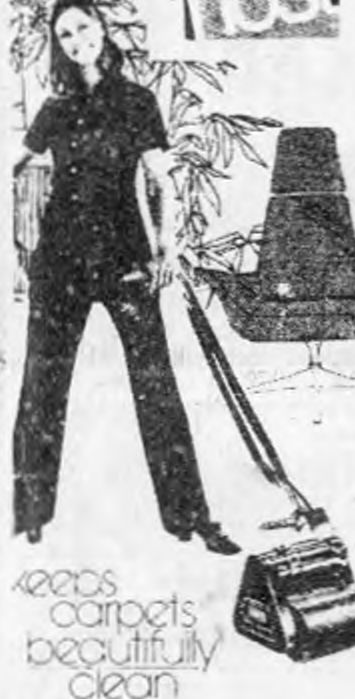
Keeps carpets beautifully clean

Culver Elementary students may leave their posters in the principal's office or they may be brought to the VFW Post Home in Culver by March 16th.