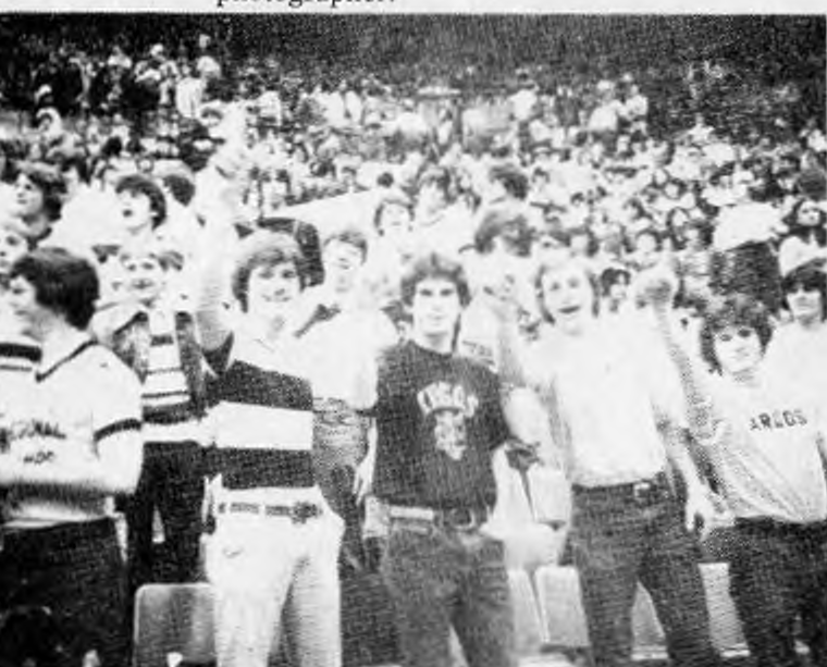
These four Argos fans show their feelings that the Dragons are No. 1.