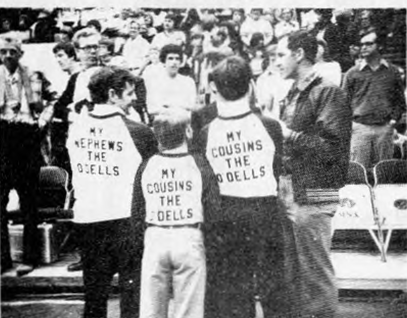
These T-shirts show the pride of the community.