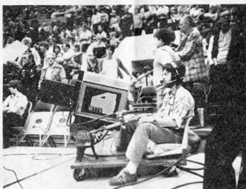
WTV Channel 4 in Indianapolis televised the game for the folks at home. Channel 4 also televised for South Bend and Fort Wayne television stations.