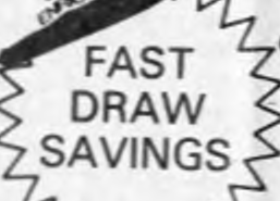
Table Fresh Produce