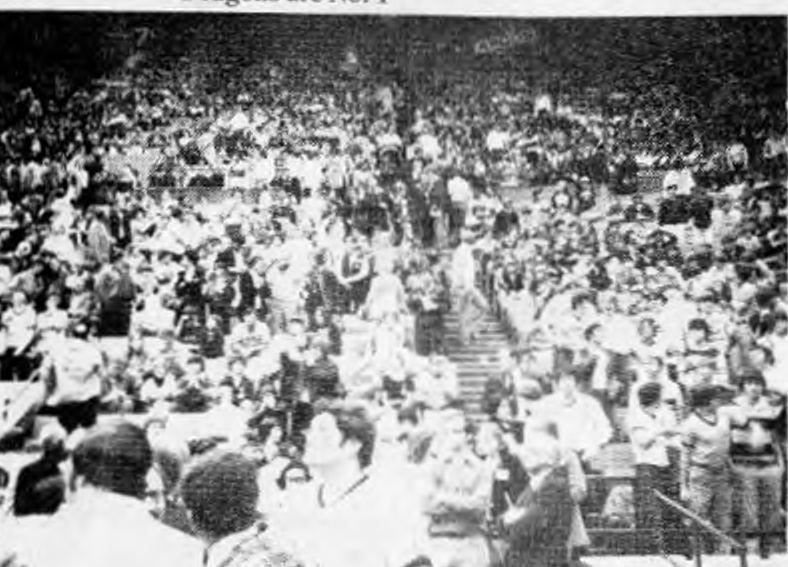
Dragon fans covered 25% of Market Square Arena from floor to ceiling.