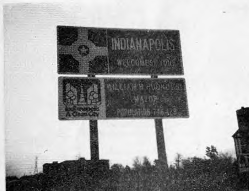
This sign greeted the Dragon fans as they entered Indiana's State Capitol.