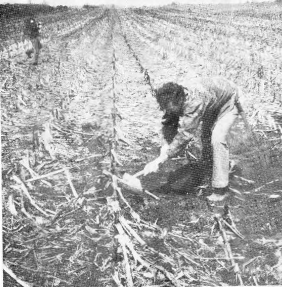
After detonating the Picric Acid, bomb squad member returns to cover the hole left by the explosion.

Culver - On Monday morning students found an area cordoned off inside the high school following the discovery that a chemical called Picric Acid (2,4,6 - trinitrophenol) was found on a shelf in the chemistry room. The chemical is harmless in its liquid state and is used to dye slides in biology. However, according to Judson Dillon, high school principal the chemical hasn't been used in all the years he can remember at the school. He stated that although, as a liquid it is harmless in a crystalline state it takes on different properties and is explosive.