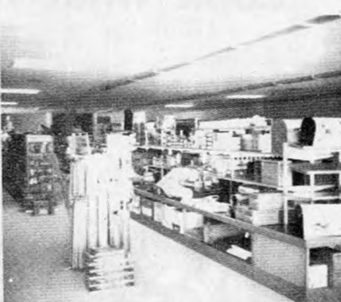
Culver - Maxinkuckee Home Supply Center is now open in their new spacious quarters on State Road 10