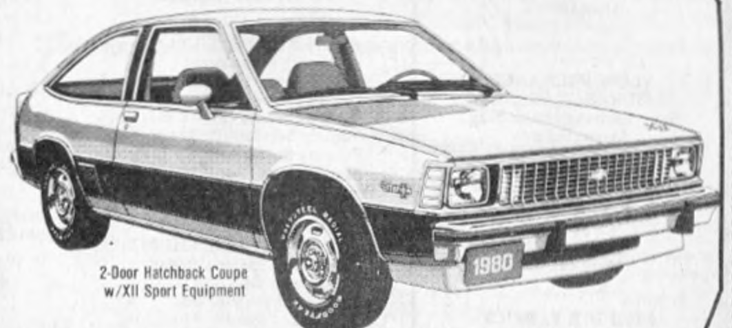
2-Door Hatchback Coupe w/XII Sport Equipment

THE FIRST-FRONT WHEEL DRIVE WITH CHEVY BEHIND IT!! A FULL 5 PASS WITH EPA ESTIMATED RATINGS TO 38 MILES PER GALLON.