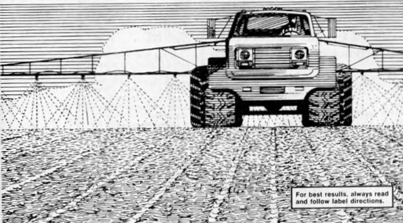
For best results, always read and follow label directions.