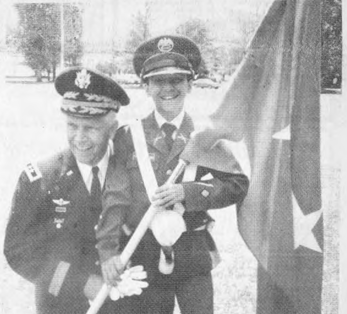
The large and the small of it. Photo taken at Culver Military Academy Memorial