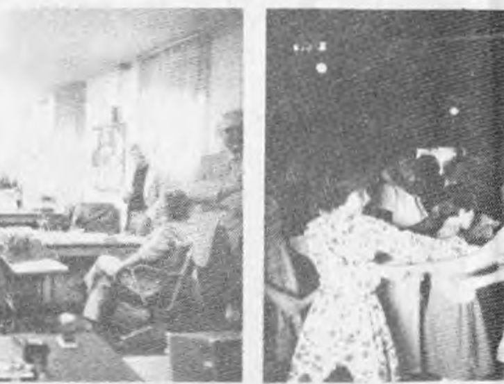
N. Water Street drew a large crowd last Friday.