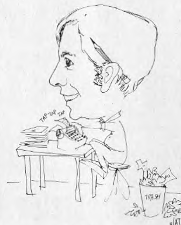
by Dave Tranter

The advertising sales personnel of your hometown newspaper contact all types of businesses each week for their advertising needs. For the last several weeks these sales people have been asking each business what they felt about the present and future economics of the United States and the local area.