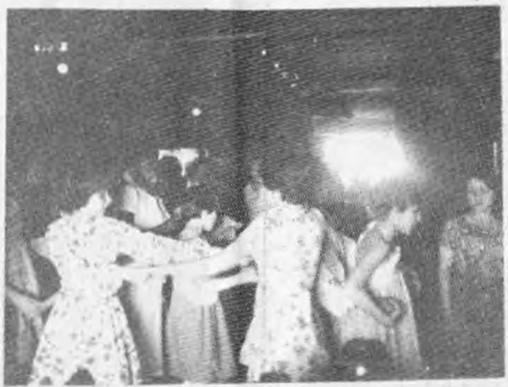
Culver - Doing the disco at La Tavola Restaurant.