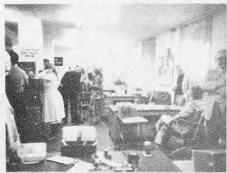
Culver - An open house for the South Bend Tribune's new Plymouth location at 109