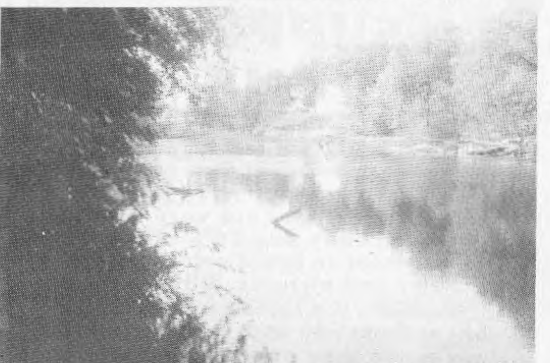
Culver - Floating down the river on a Sunday afternoon or any afternoon can be a pleasant diversion. This photo of the Tippecanoe River was taken between Leiters Ford and Delong.