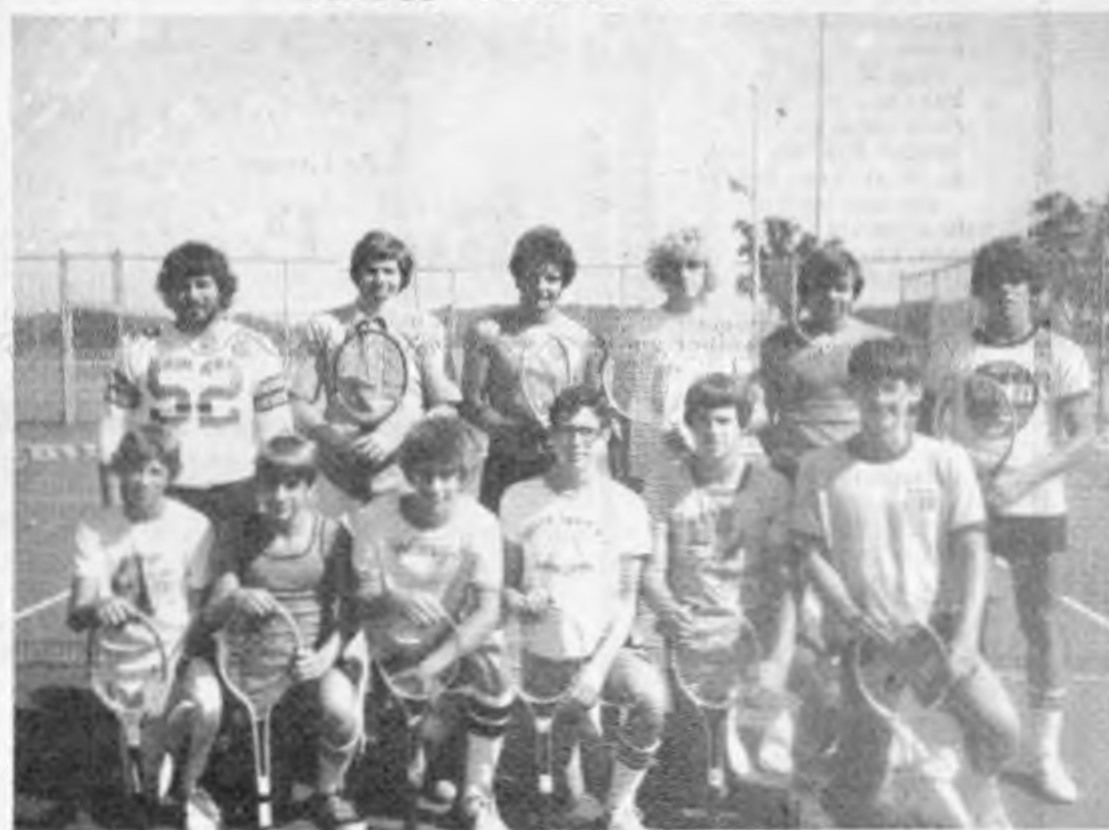
Culver - Culver's tennis team gets ready for season.