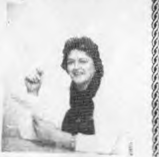
Mother Nature Is For The Birds

sure of its therapeutic value. I didn't mind the sand. It was eating it that bothered me. Try spreading a blanket on the grass, getting all the food out, then yelling, "Come out of the water, it's time to eat." Maybe it's just that there's less space on little people for sand to adhere to, but it seems like they bring three quarters of the beach with them on their bodies.