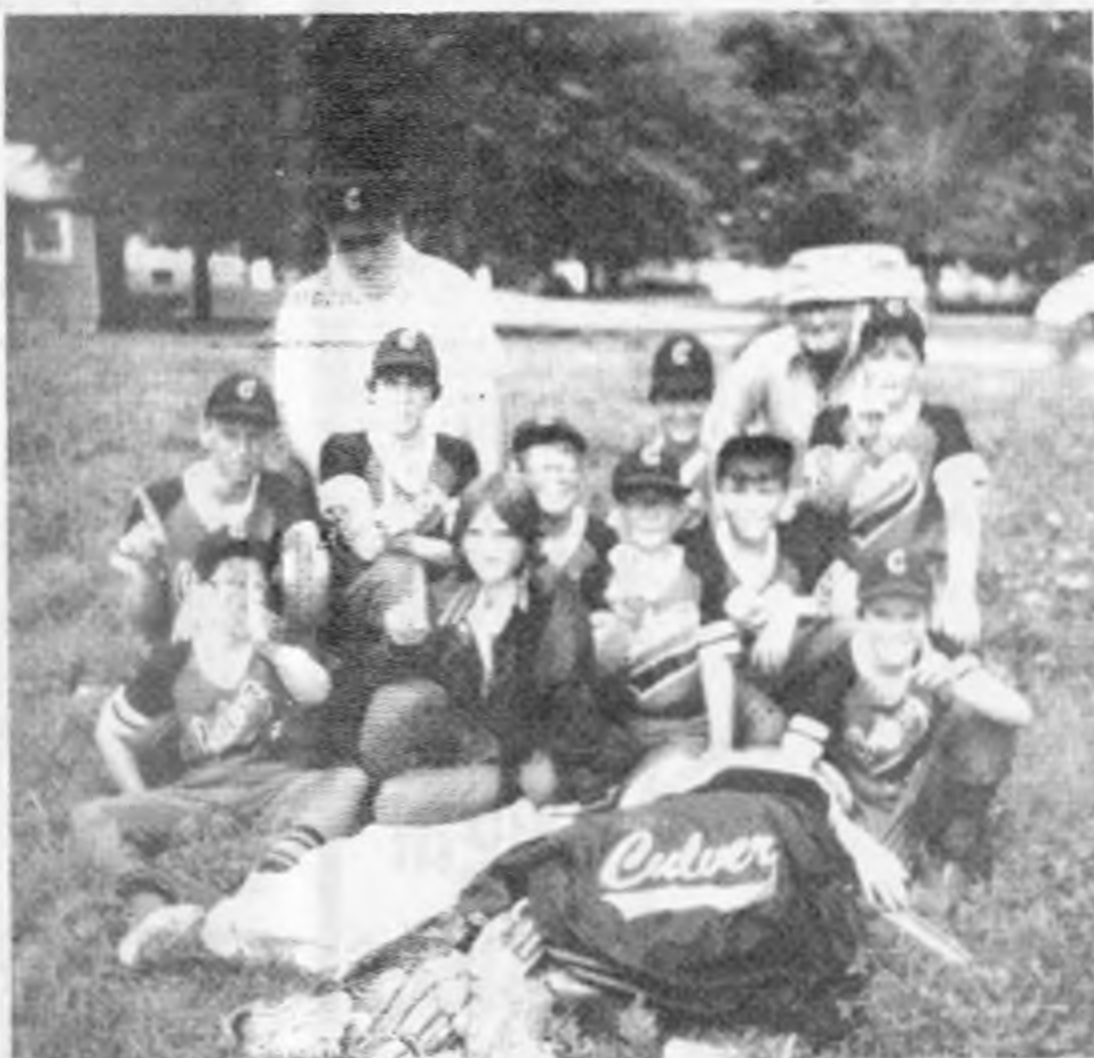
Culver - The All-Star team finished their season Sunday, August 19, on a winning note, by winning the 4-way tourney at LaVile.