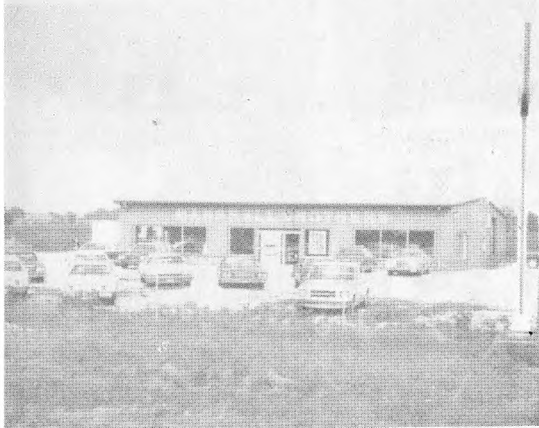
Argos - Marshall Bros. Ford, Mercury and RV center officially moved into their new offices, showroom and service center a few weeks ago. The new building is located at the junction of St. Rd. 10 and U.S. 31 on the west edge of Argos.