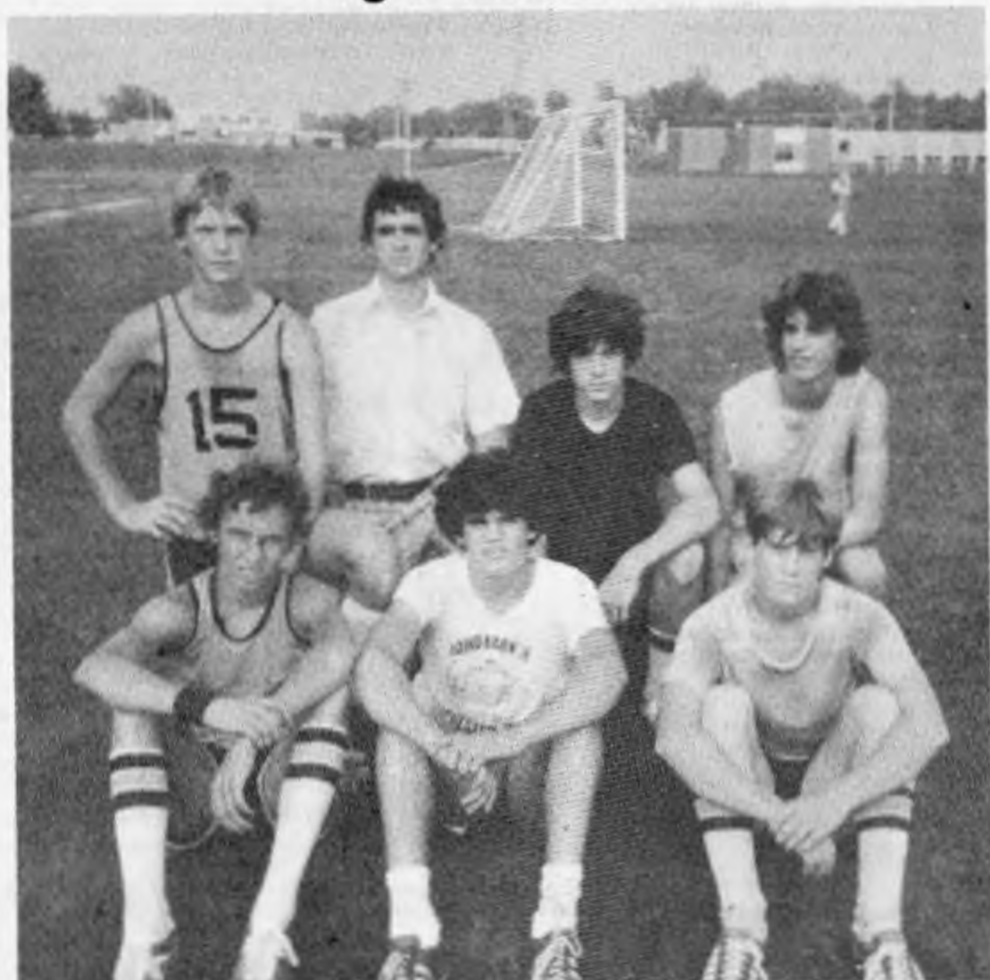
Argos - The Argos High School Cross Country runners took a break in their training Monday afternoon to