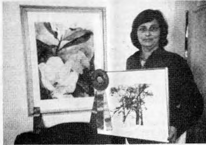
LOCAL ARTIST WINS FIRST PRIZE