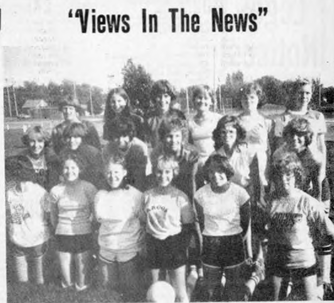
Argos 8th Grade Volleyball Team

The Cavs mounted two more scoring chances but a holding call and an interception nullified each. The Cavs play Tippecanoe Valley (No. 2 in class A) this Friday night at the Cavalier field.