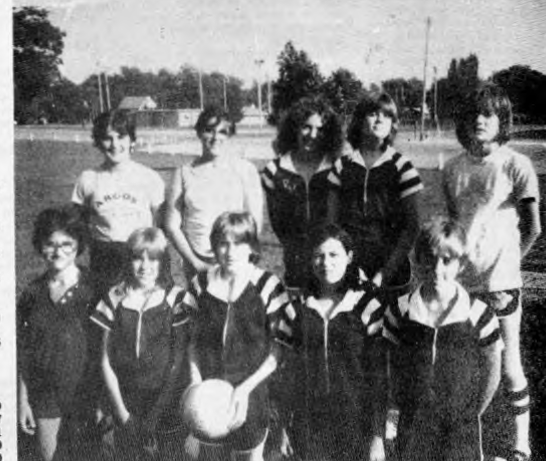
Argos 7th Grade Volleyball Team