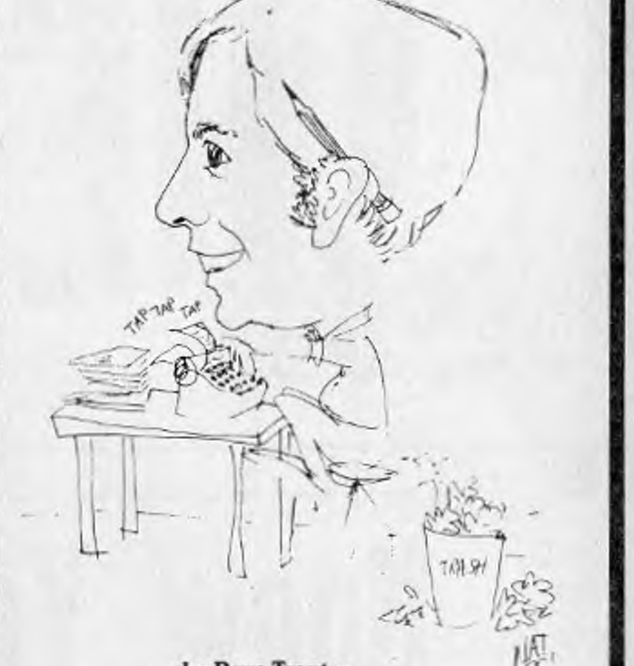
by Dave Tranter

It is with great pride that your local newspaper publishes the candidate profiles on the front page of this issue. We invite you to look over these profiles so that you can make a voting decision based on your knowledge of the candidate.