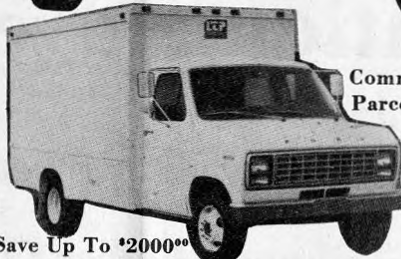
Commercials Parcel Truck