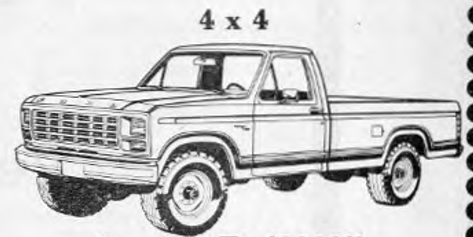
4 x 4