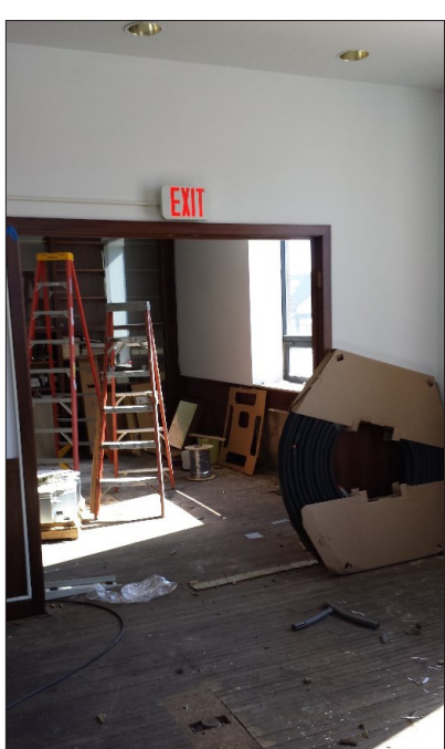
Part of the future home of the museum.