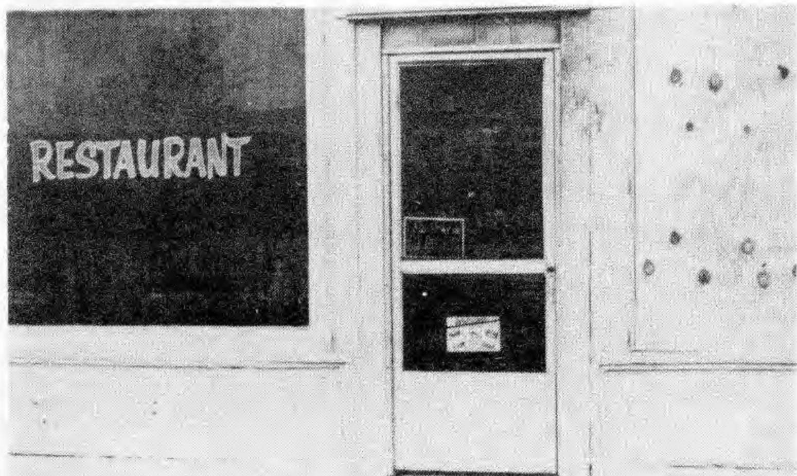
STANDING EMPTY, The Coffee Shop on Lake Shore Drive is closed following last week's fire. This makes the third restaurant closed this year in Culver.

Mrs. Onesti reports that there is much water damage to the building, in addition to the effects of the flames. As of this writing, Mrs. Onesti had not yet found a permanent place to live.