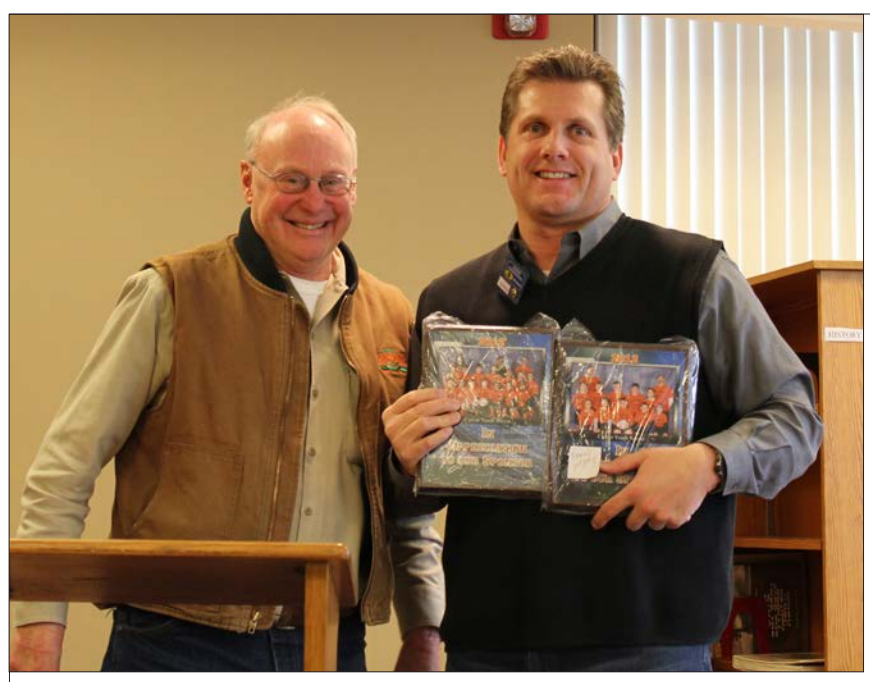
learn more about Culver Youth Soccer, visit culveryouthsoccer.org

"I hope we're headed in the right direction, and I know we are because we've had three consecutive winning seasons," he added. "The drawback is that we don't have any championships, and I measure success on the basis of championships. As far as developing players, improving players, and turning out quality young men, we're losing five of them. At the same time, we're excited with what we have coming back." • CLASS A SECTIONAL 51 TRITON 44, CULVER 32 At Culver