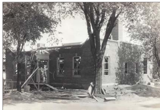
ABOVE: Two views of the construction of the Culver Post Office by Easterday Construction during the days when it was still a subsidiary of James I. Barnes Construction, in 1935. The top view faces north.