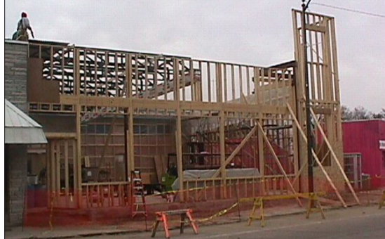
BELOW: Construction of the Edgewater Grille in 1999.