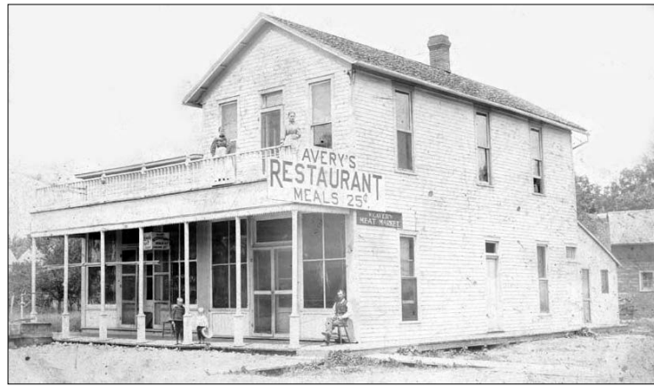
ABOVE: The Avery Park Hotel and Restaurant is believed to have been located at the site of today's Culver fire station. BELOW: The current building as seen circa 1975, when it was home to the Culver town hall, police station, and Chamber of Commerce as well as the fire dept.